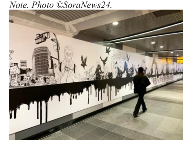
Figure 1 Massive manga mural of Jujutsu Kaisen at the Shibuya station

Furthermore, at train stations in Japan, you can regularly see massive advertisements for manga on the walls (Figure 1; Baseel, 2021). Considering other countries—for instance, in England—comic book collaborated products or murals as depicted in the figure below would be a rare case, yet it is a typical case in Japan. This manga's ubiquity in society influences manga readers in Japan who practice creative arts to express their passion for manga.